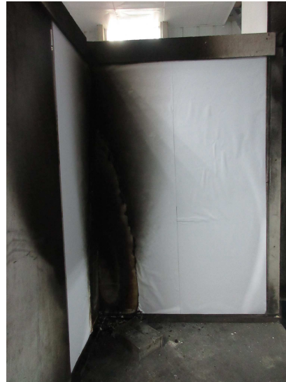
After Test (EN 13823)

SGS authenticate the photos on original report only