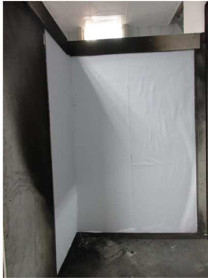
Before Test (EN 13823)